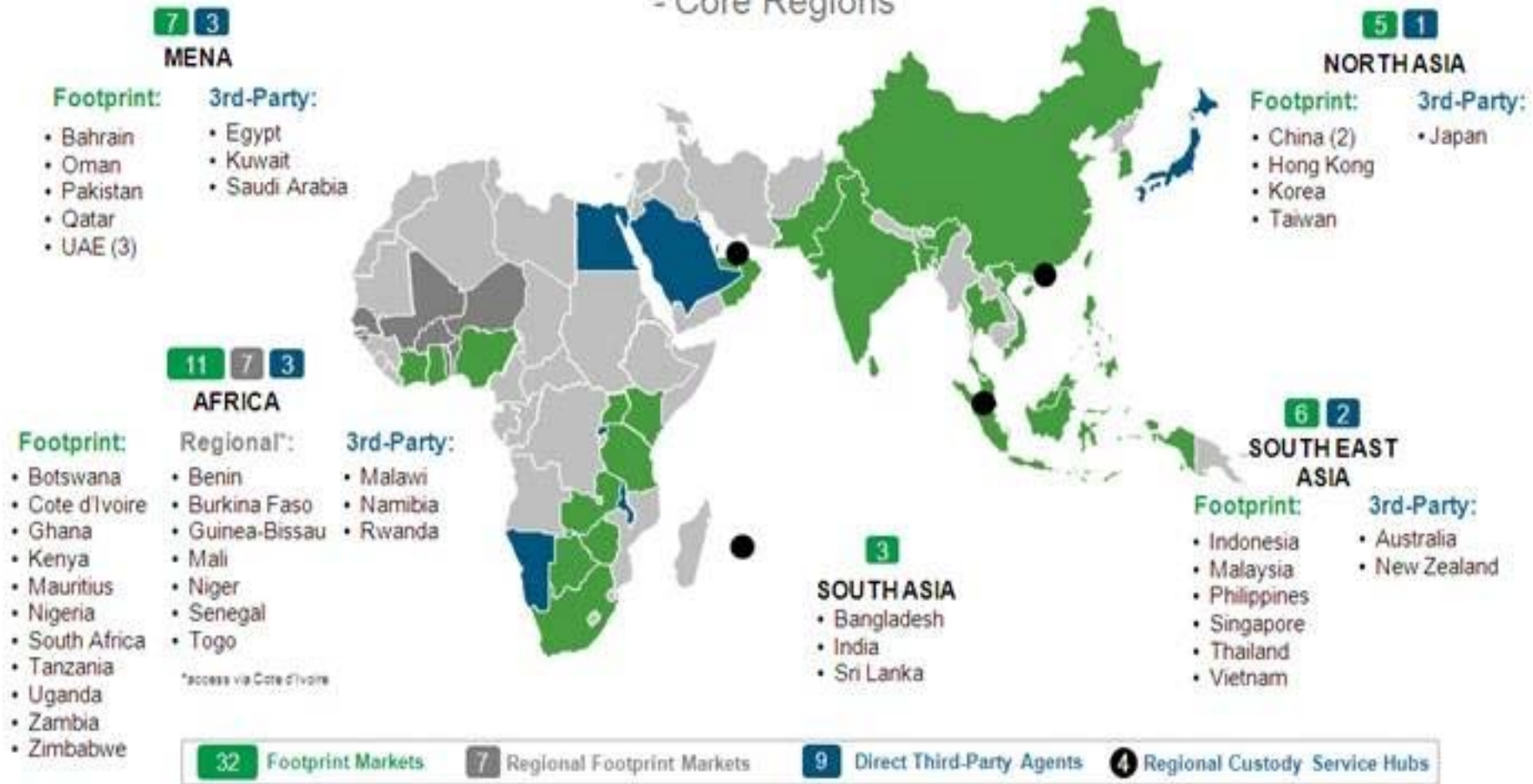
Standard Chartered Regional Custody Network Map - Core Regions